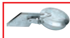
35931 4" Chrome Rain Cap