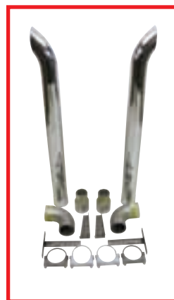
89303 & 89304 Staxx Kit